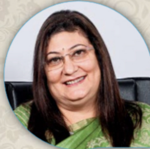
DR. MINNIE BODHANWALA WADIA HOSPITAL