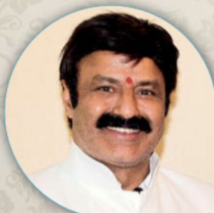
SHRI NADAMURI BALAKRISHNA, BASAVATARAKAM INDO- AMERICAN CANCER HOSPITAL & RESEARCH INSTITUTE